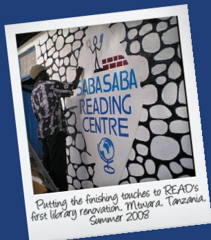
Putting the finishing touches to READ's first library renovation, Mtwara, Tanzania, Summer 2008

Teacher, Alcester High School, Warwickshire, UK